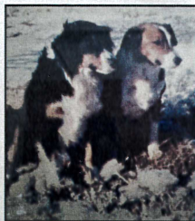
Frisky and Renie