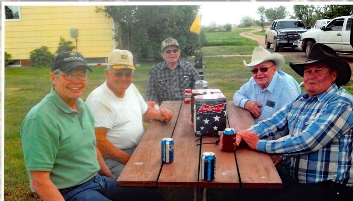
30 pack of Budweiser - $24.95. Afternoon with brothers - PRICELESS.

Fulkerson Stevenson Funeral Home ~ Sidney, Montana