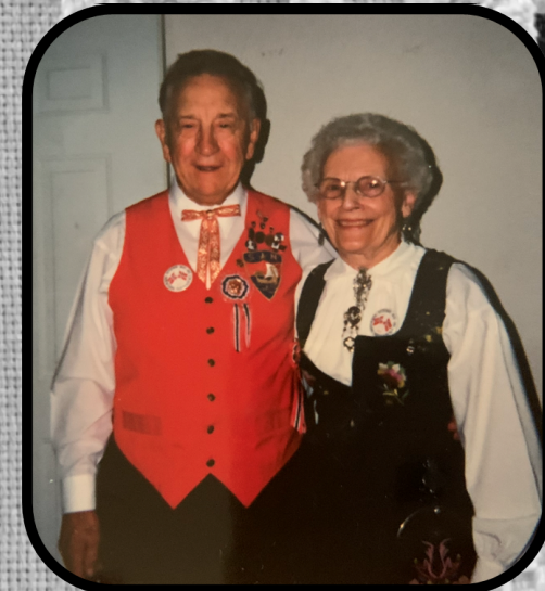
Arrangements By Fulkerson-Stevenson Funeral Home