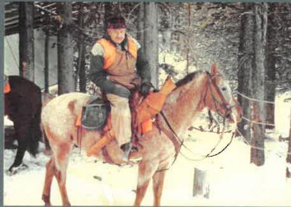
A gentleman and legend has passed here on earth, but the celebration begins in heaven.